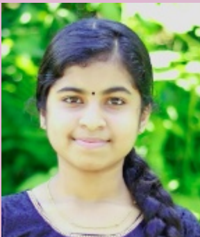
ഭവനം പി വി 10 D