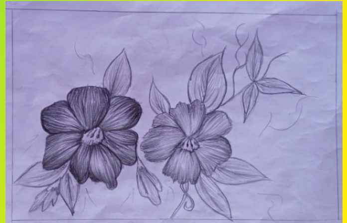
HRIDHYA SURESH 9 D