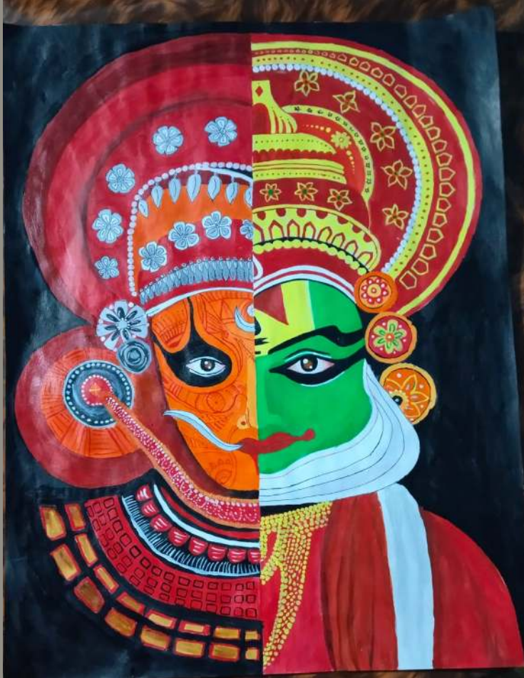
DEVANAYANA K S 9 D