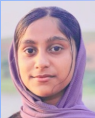
NIYA K 9 E