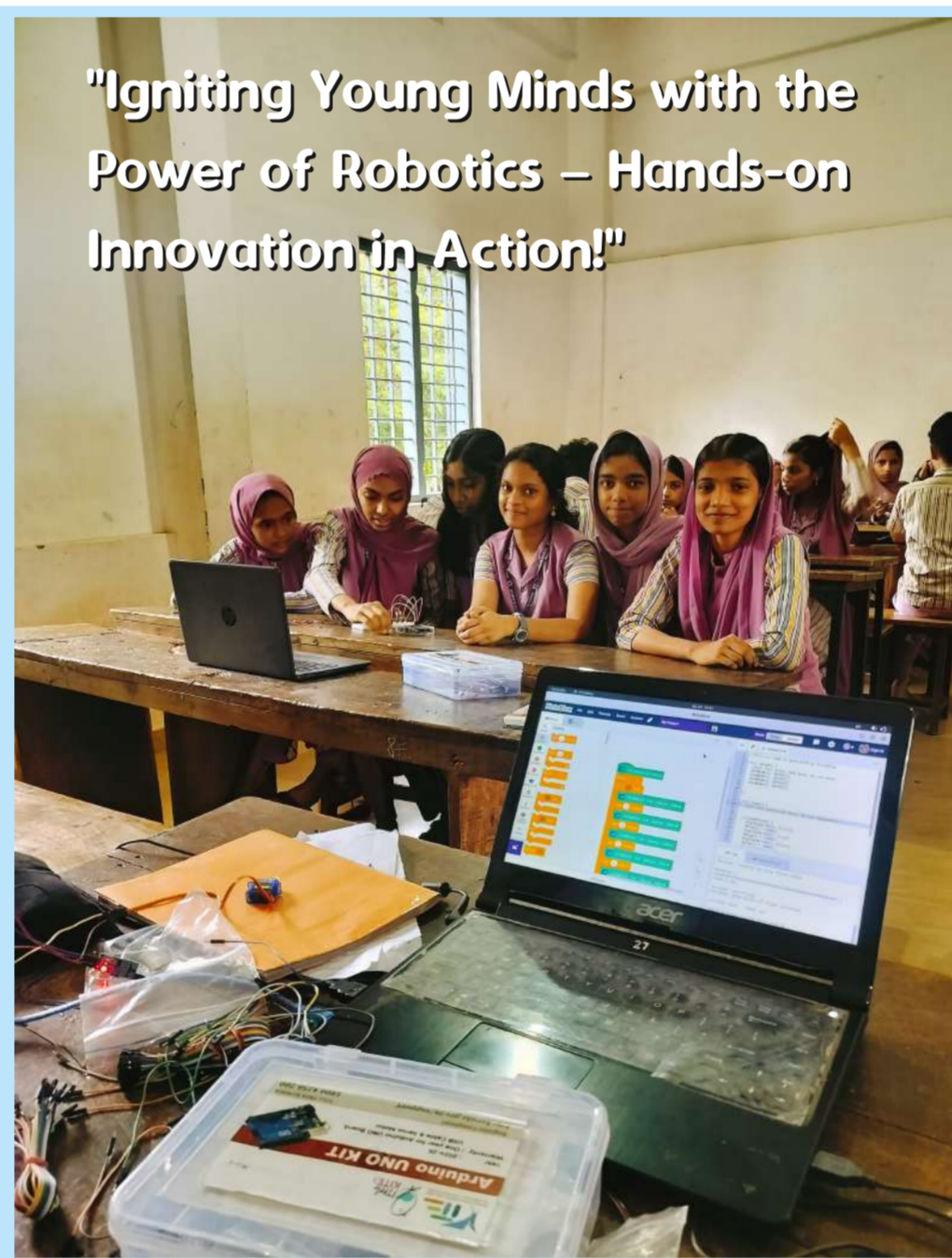
Robotics Workshop : Little Kite Students Explore the Future of Technology