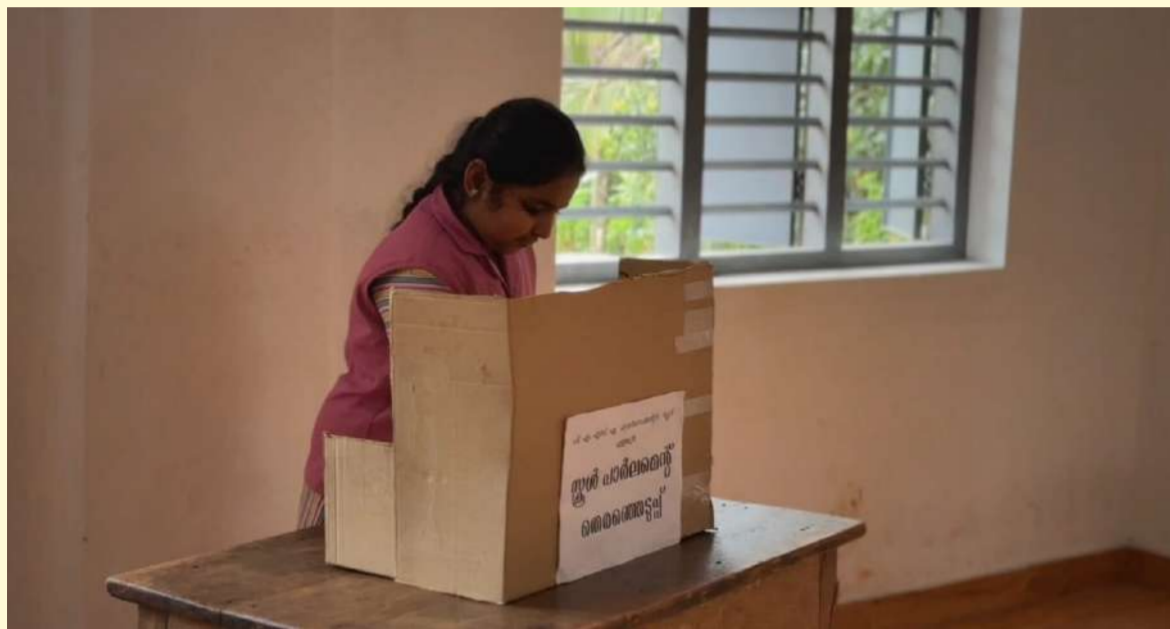
A young student casts her vote in the School Parliament election, exercising her right to choose and lead in a democratic setup.

Kites Club took the lead in organizing the event. From campaigning to voting and counting, every stage of the election was efficiently managed by the students themselves, serving as an excellent example of participatory democracy and leadership development at the school.