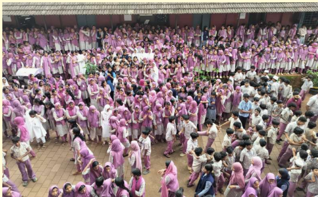
A vibrant gathering of students fills the school courtyard during the School Parliament election, showcasing unity, enthusiasm, and democratic spirit.