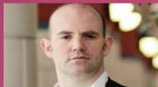
Eben Upton Software developer

Eben Christopher Upton CBE is a British technical director and ASIC architect for Broadcom. He is also a founder and former trustee of the Raspberry Pi Foundation, and now CEO of Raspberry Pi Ltd., the wholly owned subsidiary which runs the engineering and trading activities of the Foundation.