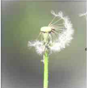
PAGE FOUR | POEM