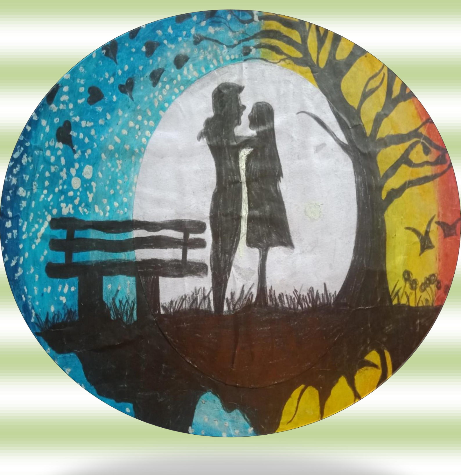
By, Nidhun X B