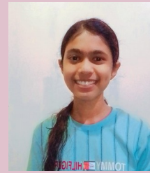
- LEKSHMI SAGANA

Mintaka ( \delta Orionis) is 1,200 light-years away and shines with magnitude 2.21. Mintaka is 90,000 times more luminous than the Sun. Mintaka is a double star. The two stars orbit around each other every 5.73 days.[6]