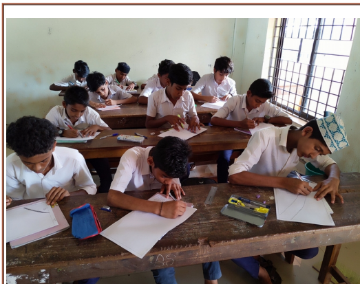
ഡിജിറ്റൽ മാഗസിനുള്ള ചിത്രരചന