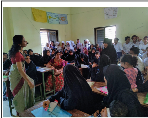
കൃത്യ ആർ കോഡ് പരിശീലനം