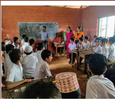
എന്നർജി മാനേജ്മെന്റ് ക്ലാസ്

ഗവ.മുസ്ലീം വൊക്കേഷണൽ ഹയർ സെക്കണ്ടറി സ്കൂൾ, കാസർകോട്